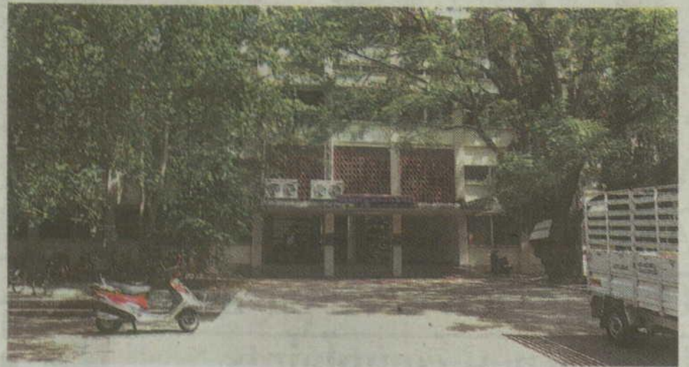
The derecognition of APSC had sparked protests in IIT-M.

tre of a controversy after it recently derecognised APSC, many of whose members are Dalits, following a complaint that it was critical of Prime Minister Narendra Modi.