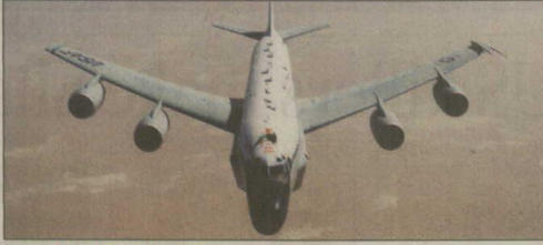
VERGING ON SCIENCE FICTION?

Even the researchers involved in the project describe it as "verging on science fiction". A team of British scientists has produced aircraft wings that can fix themselves after being damaged, hinting at the possible dominance of self-healing technology in the near future.