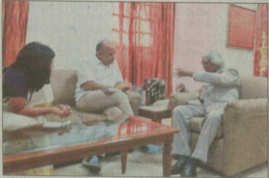
■ Delhi deputy chief minister Manish Sisodia meets former president of India APJ Abdul Kalam on Sunday.

"Our government plans to bring changes in the teachers training syllabus and induct